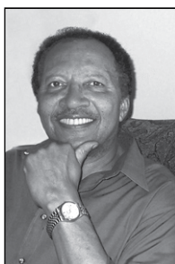
Walter Dean Myers presented the 2009 Arbuthnot Lecture.