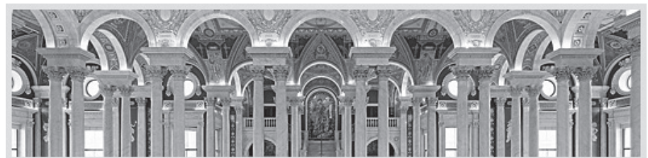
The Library of Congress will be one of the Federal Libraries

This summer a new course will be offered on Federal Libraries. Students will visit a variety of federal libraries in