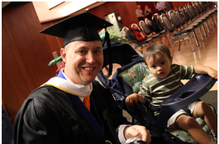
The next generation of UTK SIS graduates looks on at the 2011 Hooding Ceremony

Thank you for all your encouragement in my course work at UT. You gave me the confidence to complete my M.S. and pursue a doctorate