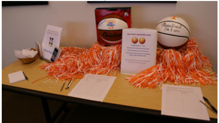
Auction items at the 2011 ALA Caribbean Fiesta, see story on page 3

To view the poster information, see: http://www.asis.org./Conferences/AM09/open-proceedings/posters/46.xml