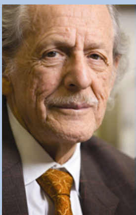
Dr. Eugene Garfield