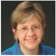
Mary Alice Ball