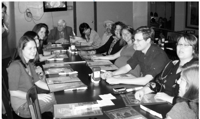
Students and faculty gather in downtown Knoxville May 2nd to relax