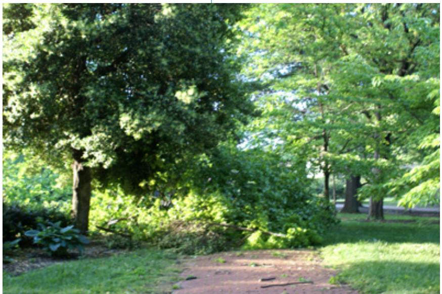
The severe storms in April didn't spare the UTK campus. Several large trees in Circle Park were damaged or blown down. The hail and wind damage was seen across the entire area.