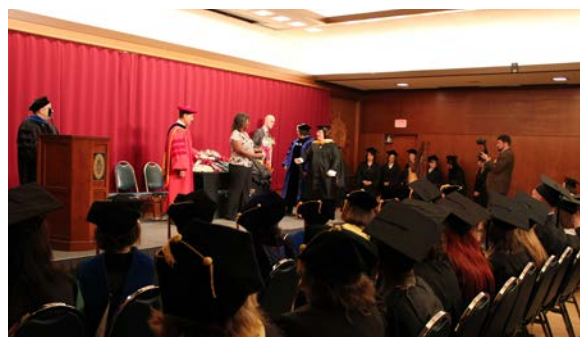
2011 Alumni Award Winners Honored along with Graduates Friends Day.